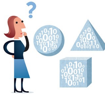
Illustration by Jørgen Stamp digitalbevaring.dk CC BY 2.5 Denmark

*Useful for digital preservation practitioner, not other users